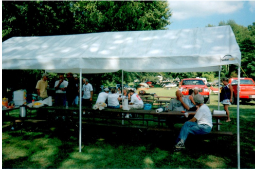
Left: NIS World Headquarters.