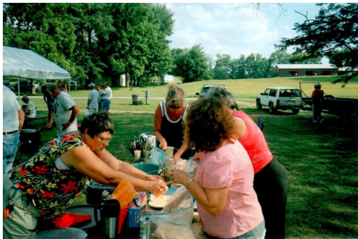
Left: NIS ladies preparing a tasty fish dinner for the gang. Right: "where we fishing tomorrow?"