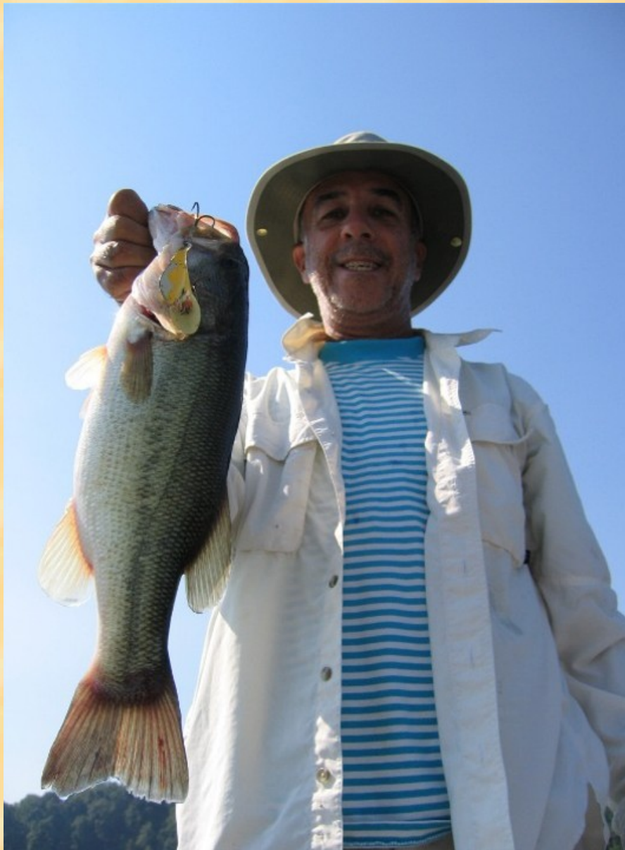
This largemouth took a 200 SP in 12' of water under bluebird skies.