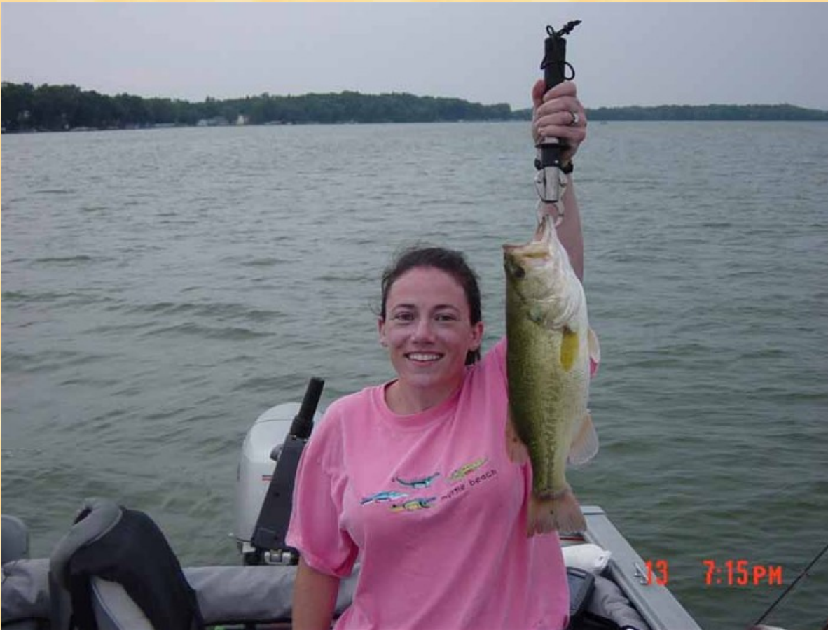
This last fish of the day shows a lake devoid of other anglers who have probably given up in disgust!