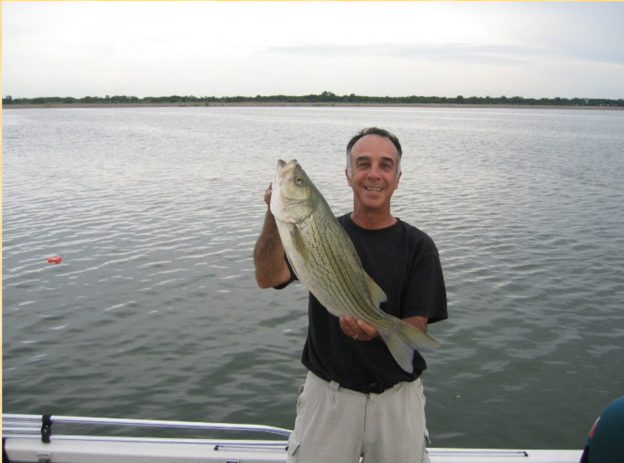
A nice little Heidecke striper.