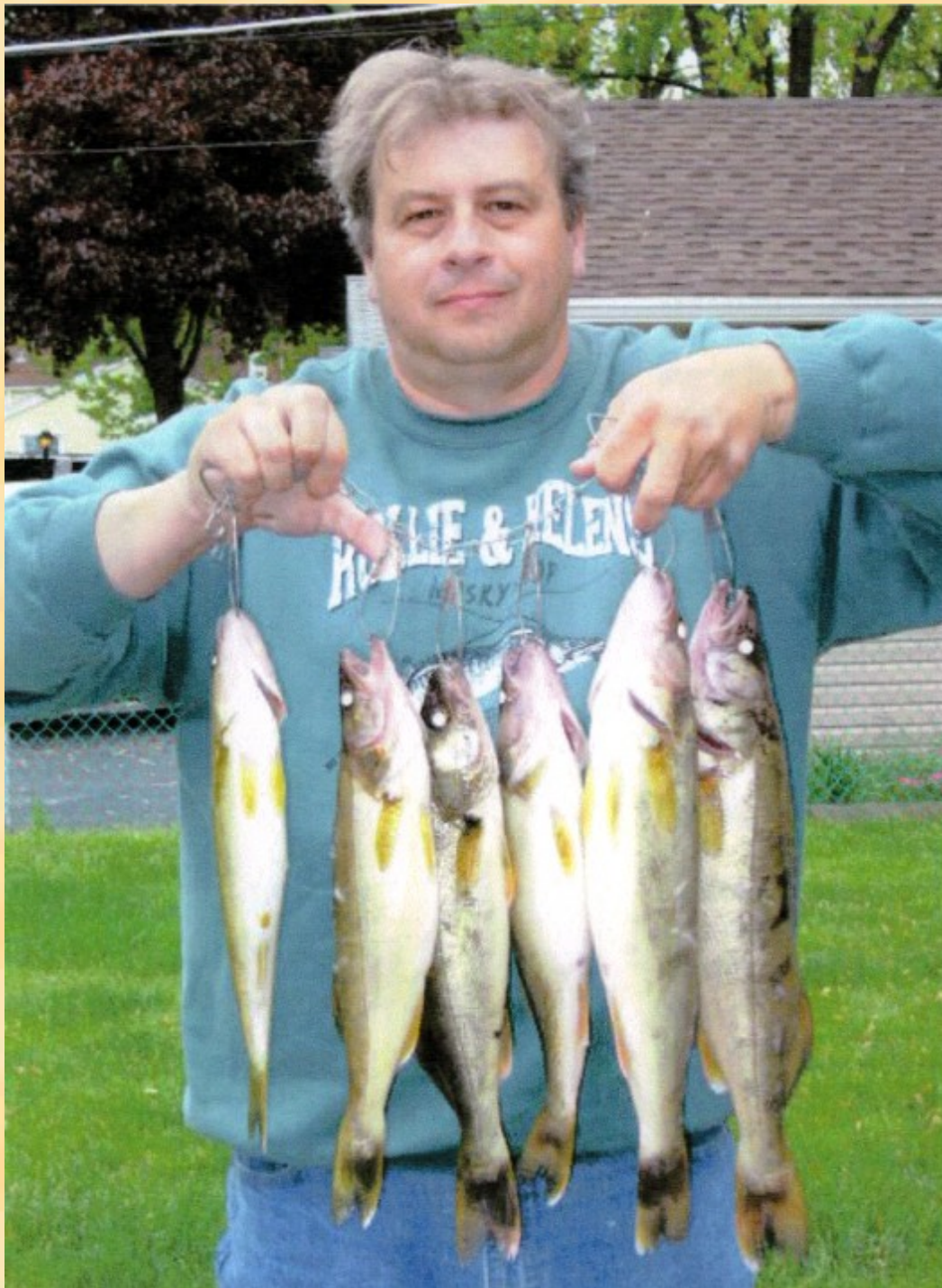
Mapping and Interpretation lead to Success and Satisfaction.